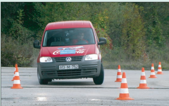
Figure 1. Stability test of the light duty vehicle during curve maneuver